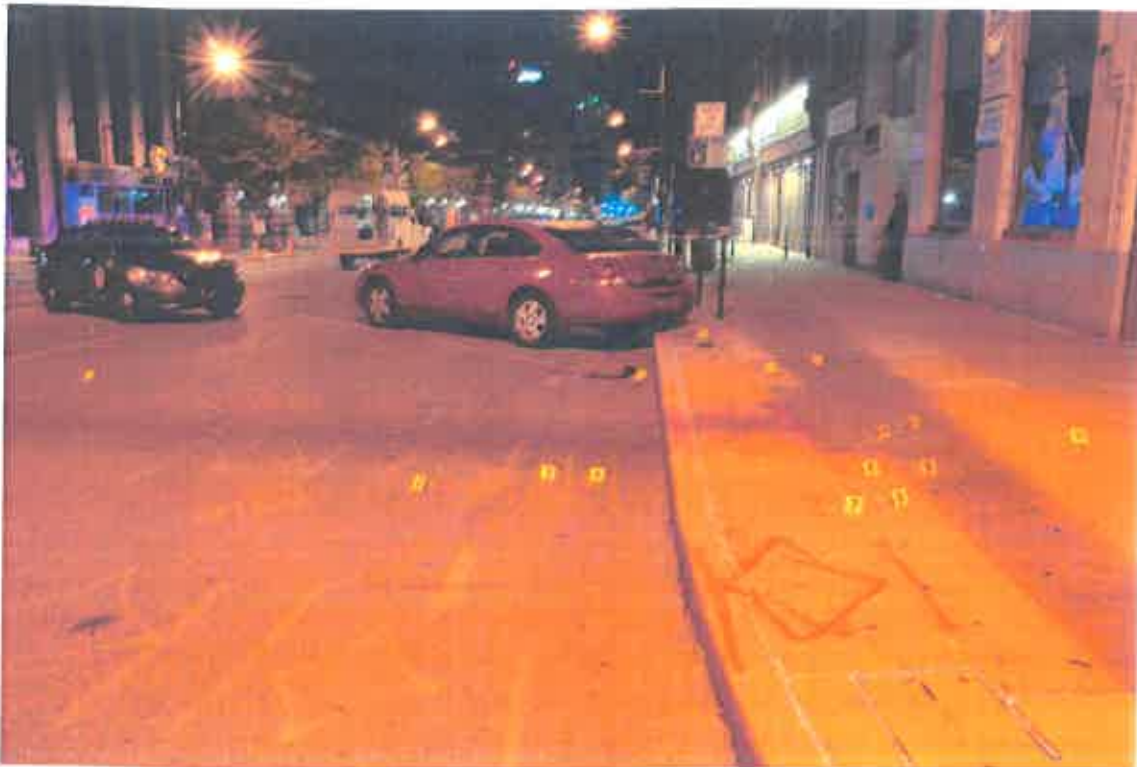
Figure 3: Area in front of Blue Store where the shooting occurred. Officer Turnure was facing the red car when he shot Mr. Redrick and Mr. Pruiett who both fell to the ground near the curb.