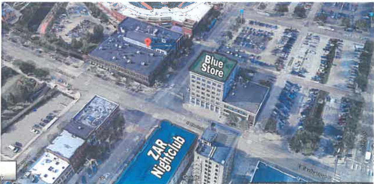
Figure 1: Officers Okoh and Turnure parked in front of Bricco restaurant (marked with red dot). ZAR nightclub is diagonal from Bricco.

This incident occurred in the early morning hours of Sunday, October 1, 2017. The area near the shooting is lined with restaurants and bars, in particular the ZAR nightclub which is at the southeast corner of Exchange and Main Street intersection. Between 2:00 a.m. and 2:30 a.m., Officers Okoh and Turnure were in their marked cruiser positioned on Main Street near Bricco restaurant. They were observing and watching for any problems that might develop as patrons left the nightclubs. While observing a large crowd gathering outside the ZAR nightclub, Officers Okoh and Turnure saw a man hold up a gun. The officers immediately went across the street to diffuse a potentially violent situation.